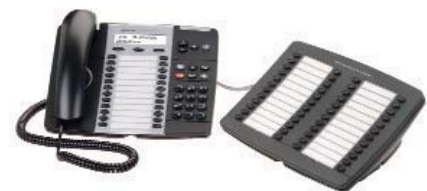
Mitel 5224 IP Phone with Mitel IP Programmable Key Modules 12 and 48 (PKM)