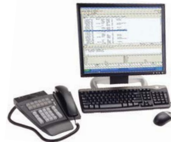
Mitel 5550 IP Console