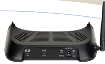
Mitel Wireless LAN Stand

Mitel Line Interface Module is a discrete optional module that integrates into the Mitel 5224, 5235, 5330 and 5340 IP Phones and provides a separate connection to an analog line. In the event of a wide area network failure the phone automatically uses the PSTN to provide continued basic telephony until service is restored. The Mitel Line Interface Module also allows for automatic 9-1-1 access to the local line.