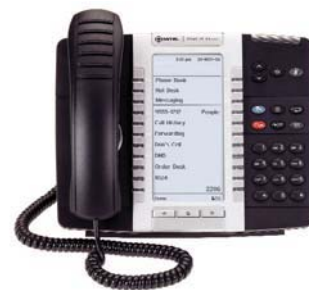
Mitel 5340 IP Phone