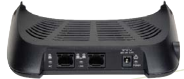
Mitel Gigabit Ethernet Stand