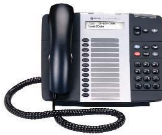
Mitel 5212 IP Phone