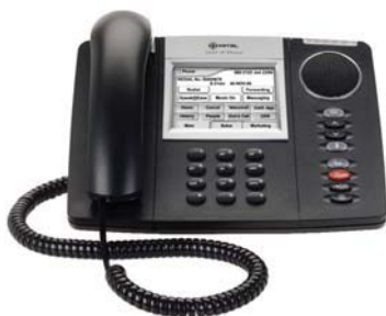
Mitel 5235 IP Phone