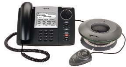
Mitel 5235 IP Phone with Mitel 5310 IP Conference Unit