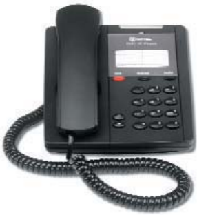
Mitel 5201 IP Phone