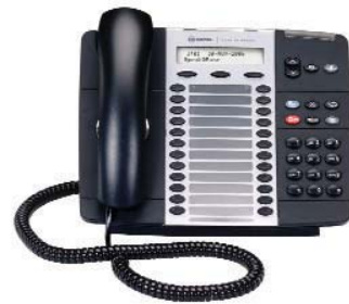
Mitel 5224 IP Phone