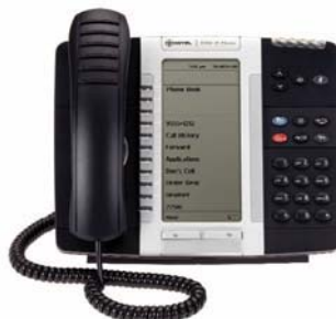
Mitel 5330 IP Phone